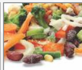
Frozen & other food