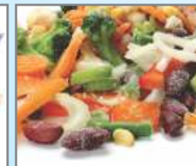
Frozen & other food