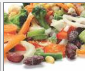
Frozen & other food